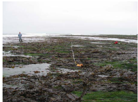
Figure 5. Dr. John Pearse standing at the 15m mark of the transect bisecting the permanent plot; the 0m mark is to the right of the red backpack.

Ideally, 20 or more quadrats should be sampled, in order for means and variances of the abundances to be calculated for statistically rigorous comparisons over time. If a visit involved 10 to 15 people, teams of 2-3 people would only need to count 3 or 4 random quadrats.