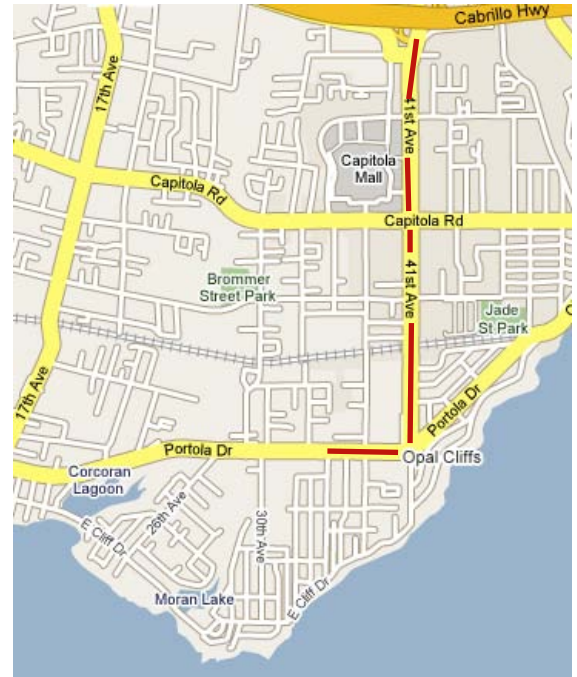
Figure 1. The 33rd Avenue site is in the vicinity of the Rockview and Opal Cliffs sites.