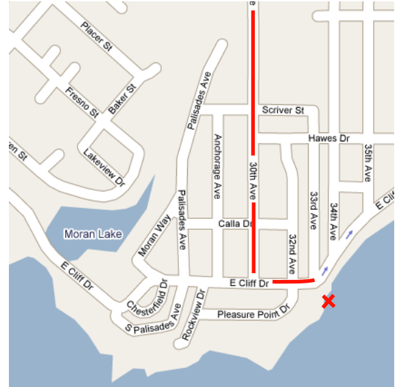
Figure 2. The 33rd Avenue site, is at the end of 33rd Ave. at East Cliff Drive.